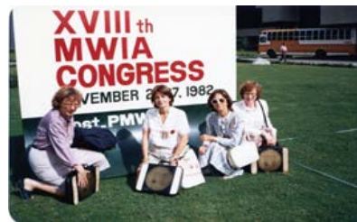
18th MWIA congress in the Philippines, 1982