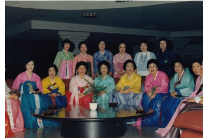
20th MWIA Congress Sorrento, Italy, 1987