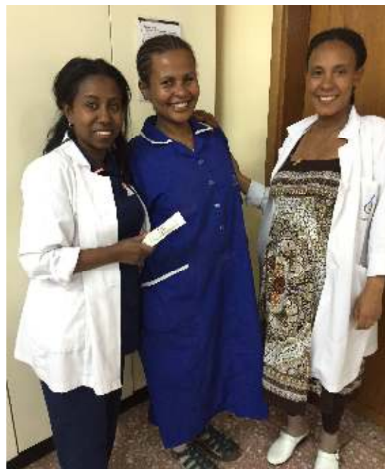
Hospital Staff at Hamlin Hospital

The Hamlin Fistula Hospital is a wonderful oasis of medical care. It is set among trees and flowers, the staff are dedicated to holistic care. Dr Catherine Hamlin is now 93 years old (her husband died over 20 years ago) and she lives on site. She is known as 'the mother of all mothers' and has created a unique centre of excellent medical care, combined with a loving and caring environment. I would highly recommend that MWIA supports the whole concept in any way that we can.