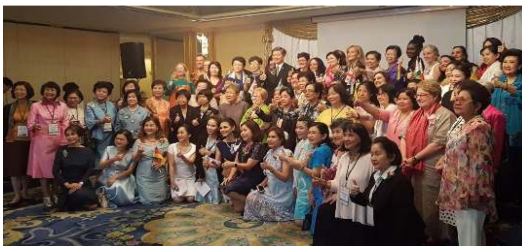
Relaxation time at Gala Dinner "Thai Night "

Although mainly in the Thai language, this link gives a flavour of the Central Asia Regional Congress https://www.youtube.com/watch?v=lttj8JhyB4g