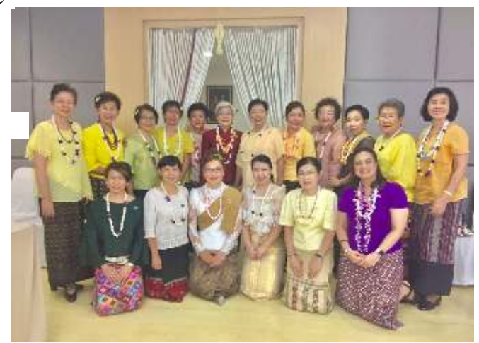
Picture of TMWA committee and members gathering to celebrate Thai New Year.

On Songkran festival, we celebrated Thai New Year with wearing Thai costumes, pouring water and offering blessings especially to elder colleagues, finished up with delicious Thai dish called "Khao Chae"