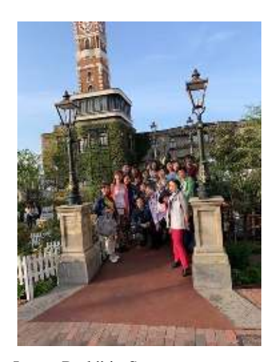
We visited "White Lover Park" in Sapporo as an excursion on May 18th