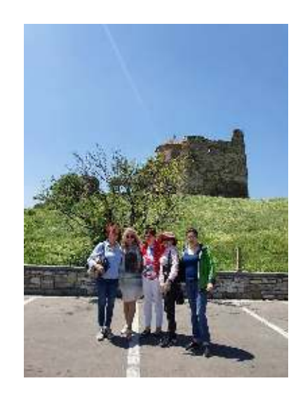
The Cultural Tour for foreign guests was held within the Congress. The Congress ended with the Gala Dinner, where we were entertained with national dances and songs.