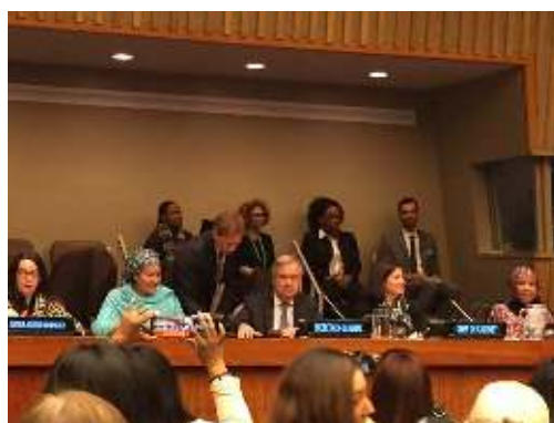
Antonio Guterres and Exec Director UN Women, Phumzile Mlambo-Ngcuka (far right)