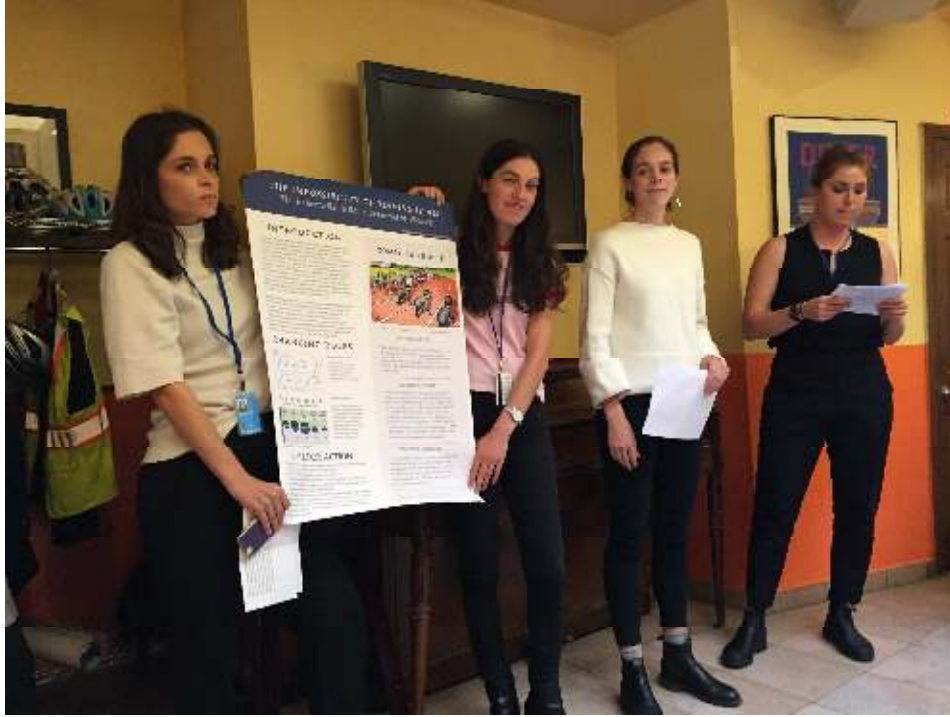
The Medical Women’s Association of Nigeria had a parallel event as well that was held on Friday, March 15 th . The title of their event was “Social and Economic Consequences of Teenage Pregnancy: Enhancing Our Social and Economic System.”