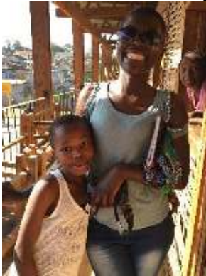
Survivor with her daughter

school nearby was nearing completion, funded and supervised by an Italian architect and his group. As my guide said, keeping girls in school is the most effective way to protect girls from violence, FGM, early child marriage and teenage pregnancy. Rescue centres should also be supported and equipped to salvage out-of-school girls. MWIA is well-placed to raise awareness, and advocate for change at Government and community levels.