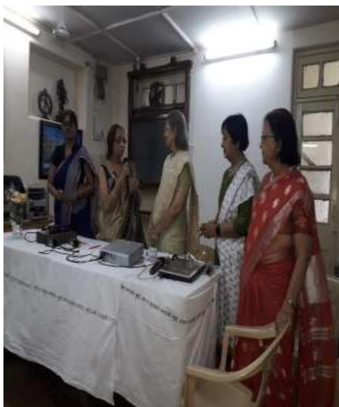
Out going President giving a donation of Rs 50,000 to AMWI