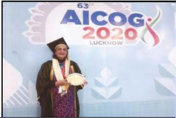
ICOG Founder Member Award