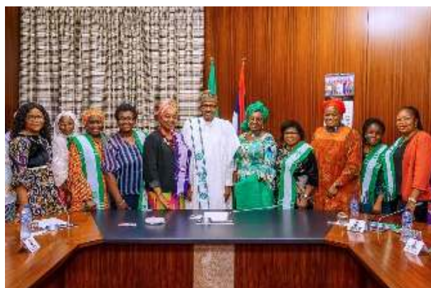
Presidents, Minister and MWAN members

In his twitter handle President Buhari said the following: