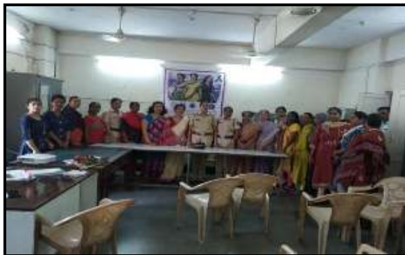
Vikroli Mumbai Police Camp