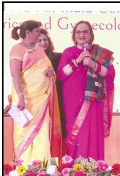
Acceptance speech after the Award