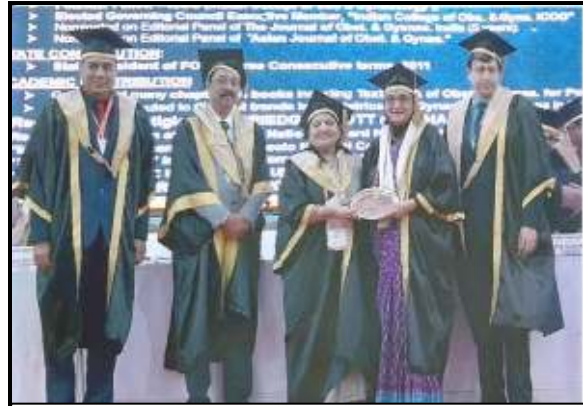
Founder Member Award at Convocation