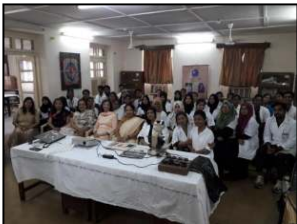
Training of Technicians at Camp