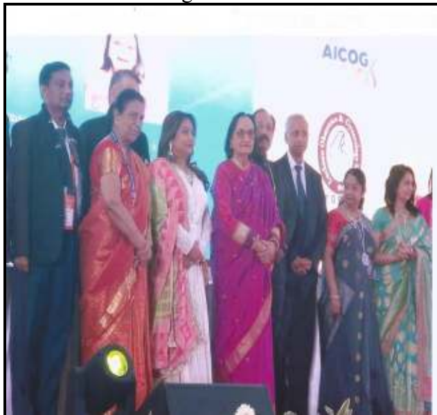
FOGSI Lifetime Achievement Award