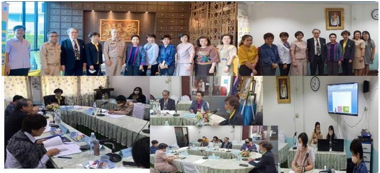
On June 22, 2020 The Uttaradit Provincial Teenage Pregnancy Committee hosted 'Teenage Pregnancy Prevention and Solution progression meeting'. This aimed to develop the integrated working between public health, education and social support.