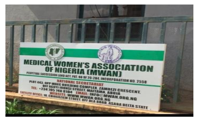
erected at the Secretariat in Abuja, Nigeria.