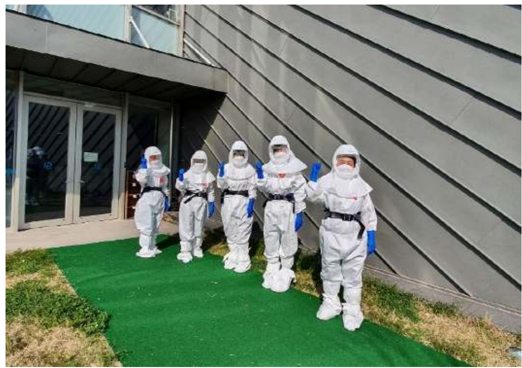
Fig.4 Medical personnel fully dressed in protective clothing outside and moving inside to treat patients.