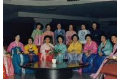
20th MWIA Congress Sorrento, Italy, 1987