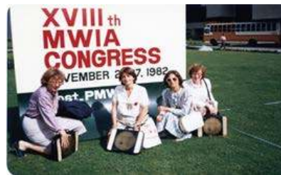
18th MWIA congress in the Philippines, 1982