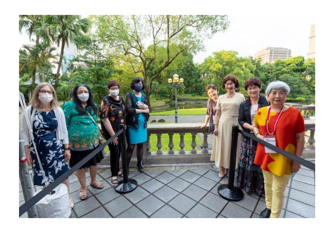
International congress delegates from all over the world