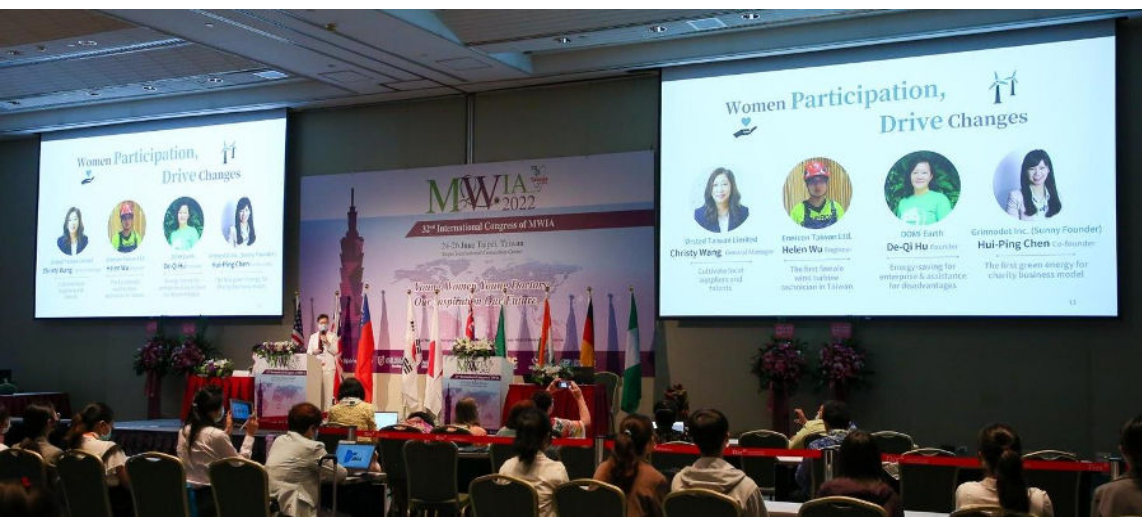
The Minister of Ministry of Economic Affairs Ms. Mei-Hua Wang gave a talk on "The Economic Development in Taiwan & Women's Economic Empowerment"