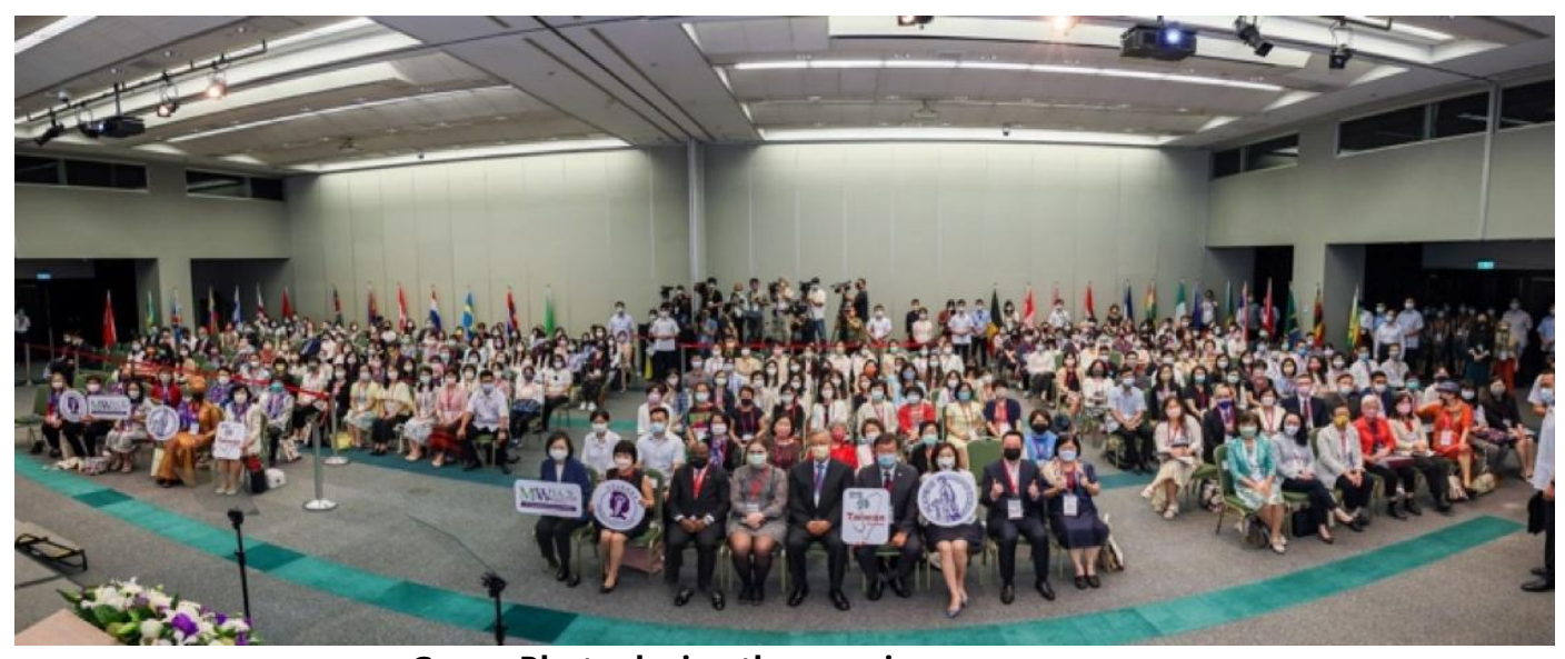
Group Photo during the opening ceremony