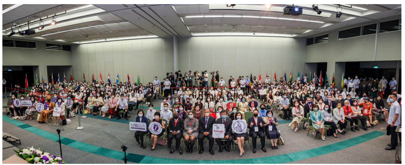
Program Book: https://www.mwia2022.net/downloads/MWIA2022 Program Book.pdf

Congress Website: <a href="https://www.mwia2022.net/">https://www.mwia2022.net/</a>