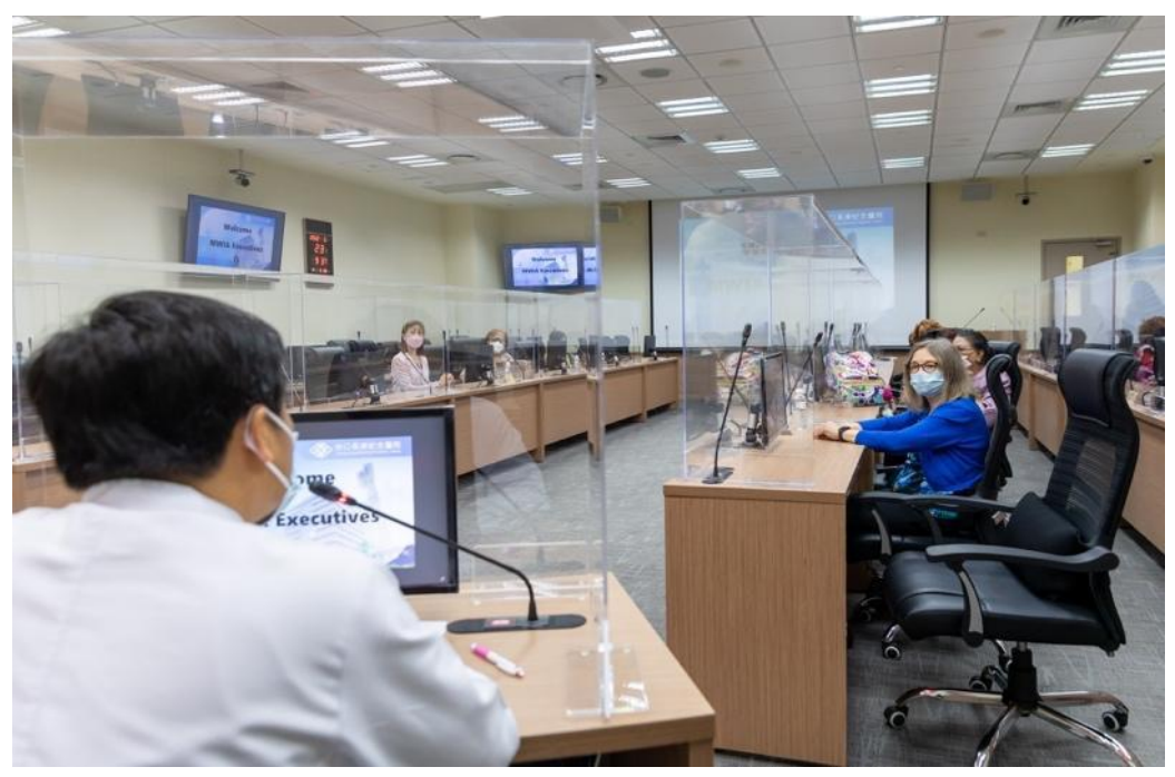
Hospital Introduction to guests in a meeting room well prepared with adequate spacing to fit COVID regulations