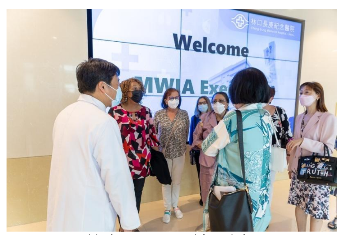
Visit Chang Gung Memorial Hospital

On June 23, 2022, the pre-congress tour was arranged for congress delegates to visit Chang Gung Memorial Hospital, Linkou Branch. Founded in 1978, Linkou Chang Gung Memorial Hospital (CGMH) is a JCI accredited, multi-specialty, tertiary referral medical center situated in Taiwan. CGMH has been listed among one of the largest, most prestigious, medical and educational centers in Asia, containing nearly 4,000 beds and a total of 29 specialty centers. Not only trained local doctors and medical professionals, the hospital has trained more than 1,700 practicing physicians from 75 different countries in the last decade up to now.