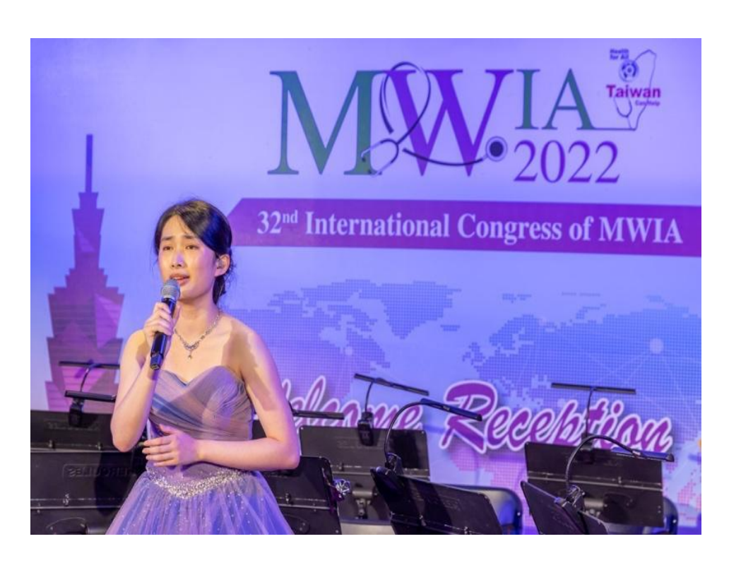
A soprano solo by a medical Woman, a pediatrician.