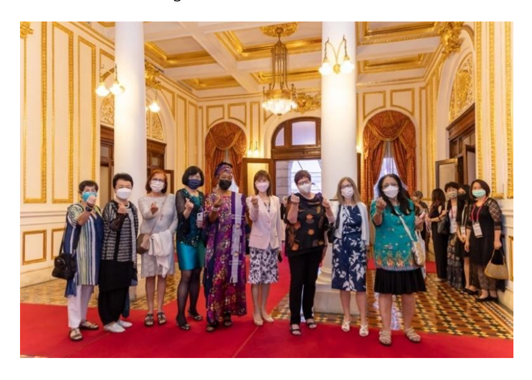
International congress delegates from all over the world

The local committee invited Taipei First Girls' High School Alumnae Wind Ensemble (TFGAWE) which comprises outstanding female players to give a wonderful performance, underscores the excellence of the outstanding women.