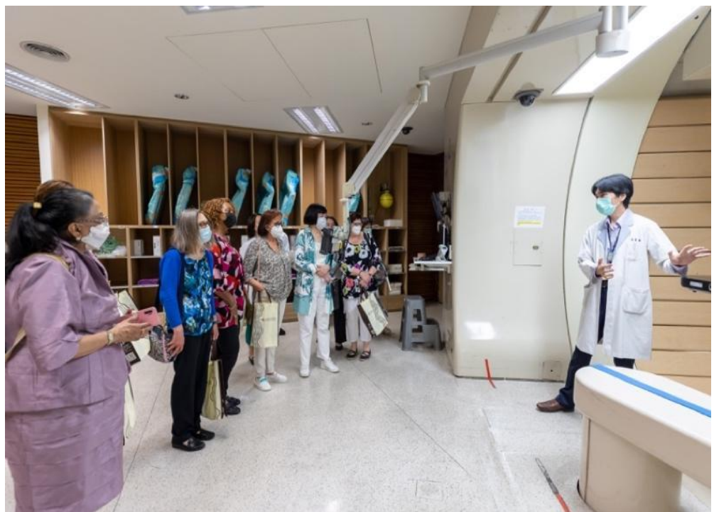
Introduction of Proton Therapy and Other Radiotherapy at Chang Gung Memorial Hospital